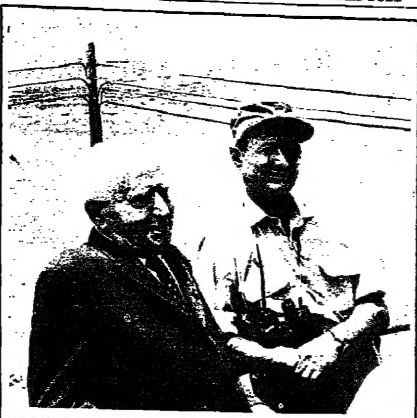
REUNION AT SHAHM. — Former Premier David Ben-Gurion met Defence Minister Moshe Dayan yesterday, near the famous Ras Nazranai guns at Sharm el-Sheikh, during the filming of a movie on Ben-Gurion's life. The two discussed the capture of the spot in the 1956 Sinai Campaign.